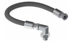
DRAINAGE KIT PLURY back pressure MAX 15 BAR