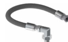
KIT DRAINAGE PLURY contre-pression MAX 15 BAR