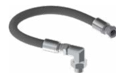
KIT DRAINAGE PLURY contre-pression MAX 15 BAR